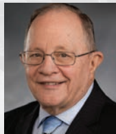
Mike Padden 4th District Senator (R)