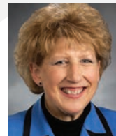
Shelly Short 7th District Senator (R)