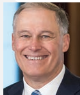
Jay Inslee Washington State Governor (D)