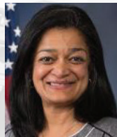
Pramila Jayapal 7th District US House of Representatives (D)