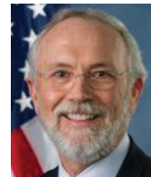
Dan Newhouse 4th District US House of Representatives (R)