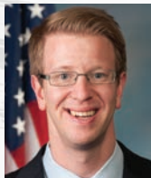
Derek Kilmer 6th District US House of Representatives (D)