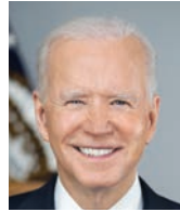
Joseph Biden United States of America President (D)