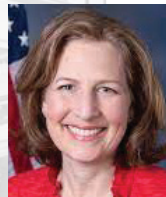
Kim Schrier 8th District US House of Representatives (D)