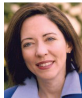
Maria Cantwell US Senator (D)