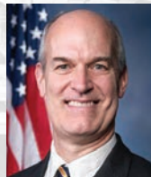
Rick Larsen 2nd District US House of Representatives (D)