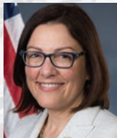
Suzan DelBene 1st District US House of Representatives (D)