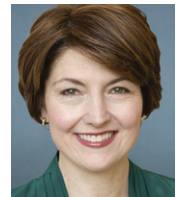
Cathy McMorris Rodgers 5th District US House of Representatives (R)