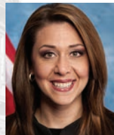
Jaime Herrera Beutler 3rd District US House of Representatives (R)