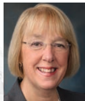
Patty Murray US Senator (D)