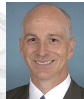
Adam Smith 9th District US House of Representatives (D)